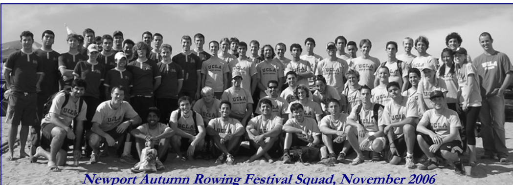
Newport Autumn Rowing Festival Squad, November 2006