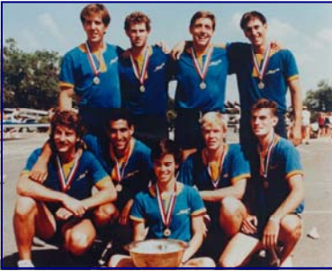
1989 Pac-10 Champions