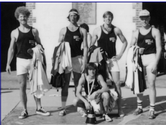
1973 IRA Varsity Four Champions

If you have been thinking about what it would be like to race again, here is your chance to represent UCLA on the water once again. Go Bruins!