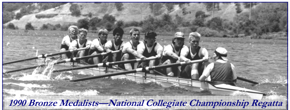
1990 Bronze Medalists—National Collegiate Championship Regatta