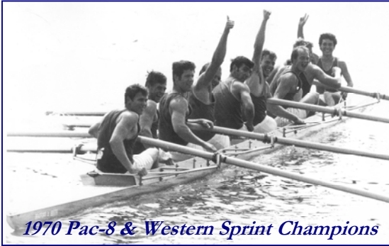
1970 Pac-8 & Western Sprint Champions