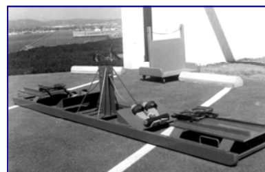
Rowing Sled Circa 1968